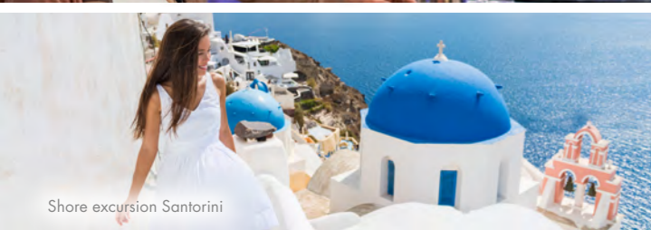
Shore excursion Santorini