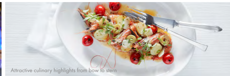
Attractive culinary highlights from bow to stern