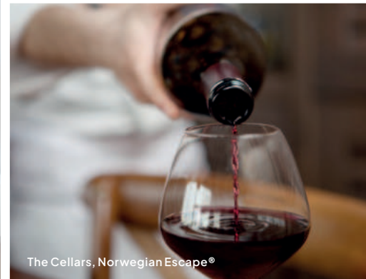
The Cellars, Norwegian Escape®