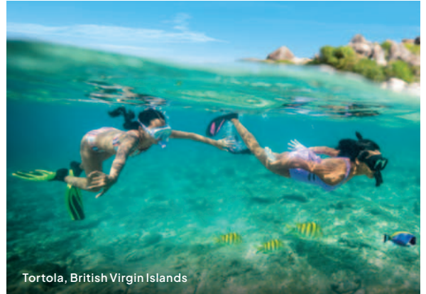
Tortola, British Virgin Islands

US$ 50 discount per stateroom and excursion. Discount is always credited to the first person in the stateroom. Also included are the ports of disembarkation. Discount will apply automatically to guest 1 in a reservation when shore excursions are booked via the agent booking engine, ncl.com or our call centre. Reservations need to be in BK status (confirmed) to book shore excursions. The US$ 50 discount will automatically be converted into local currency. Any shore excursions costing less than US$ 50 will receive 100% discount, reducing the price to zero. Rentals on Great Stirrup Cay/Harvest Caye are excluded. Embarkation ports are not included either. The discount is non-transferable and cannot be added up for use in individual ports. Can be used on multiple shore excursions in the same port.