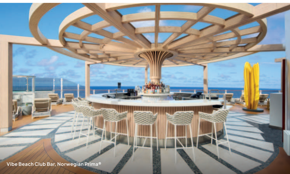
Vibe Beach Club Bar, Norwegian Prima®