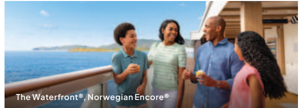
The Waterfront®, Norwegian Encore®

On select cruises. The cruises are marked accordingly in the reservation systems. You will also find an overview of cruises on ncl.com/more-at-sea . If there are 5–8 guests on a reservation, those guests will be required to pay regular fares.