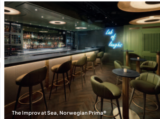
The Improv at Sea, Norwegian Prima®