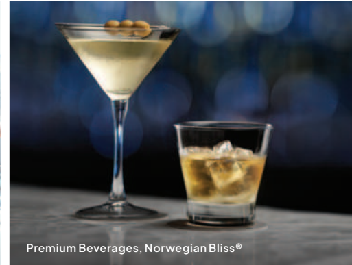
Premium Beverages, Norwegian Bliss®